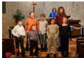
Sunday School Sings