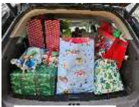
Giving Tree Gifts ready to deliver